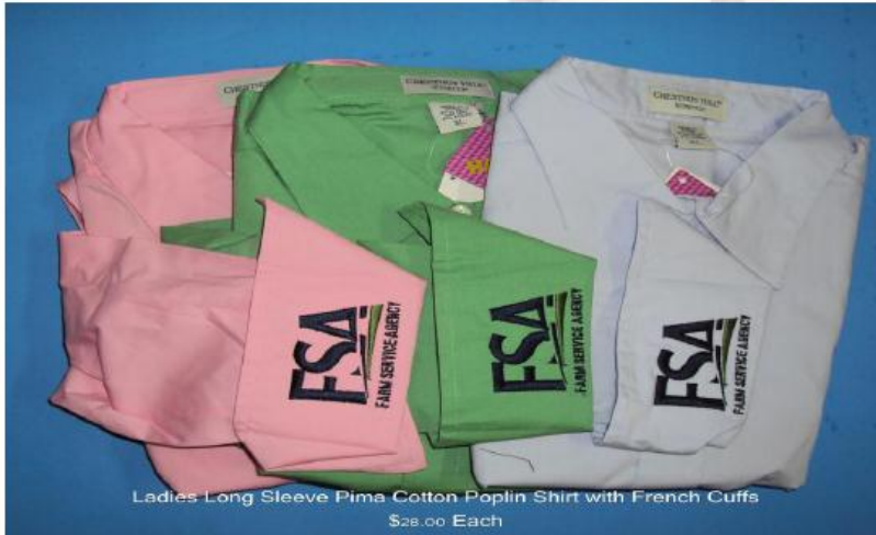
Ladies Long Sleeve Pima Cotton Poplin Shirt with French Cuffs $28.00 Each

These highly sought after new Ladies long poplin shirts with embroidery on the French cuff – very classy and only available at the NASCOE Store are flying off the shelves! Wow your customers and co-workers with this very ritzy office attire (at a fraction of the price of traditional poplin shirts):